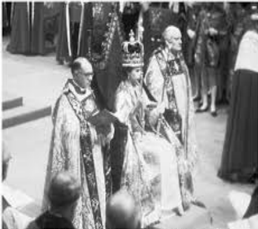
THE OLD CORONATION CHAIR , at right, in Westminster Abbey, London. Under it lies a stone, said to have been brought to Ireland by Jeremiah the prophet and upon which many kings of Scotland and England have been coronated.

"Oh Lord and Heavenly Father, exalter of the humble and the strength of Thy chosen, who by anointing with this oil didst of old, make and consecrate, kings, priests, and prophets, to teach and govern Thy people Israel. Bless and sanctify Thy chosen servant, Elizabeth, who by our office and ministry is now to be anointed with this oil".